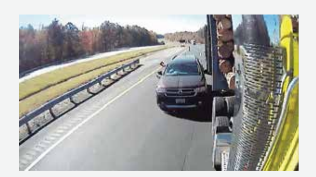
Example of A Fraudlent Claim